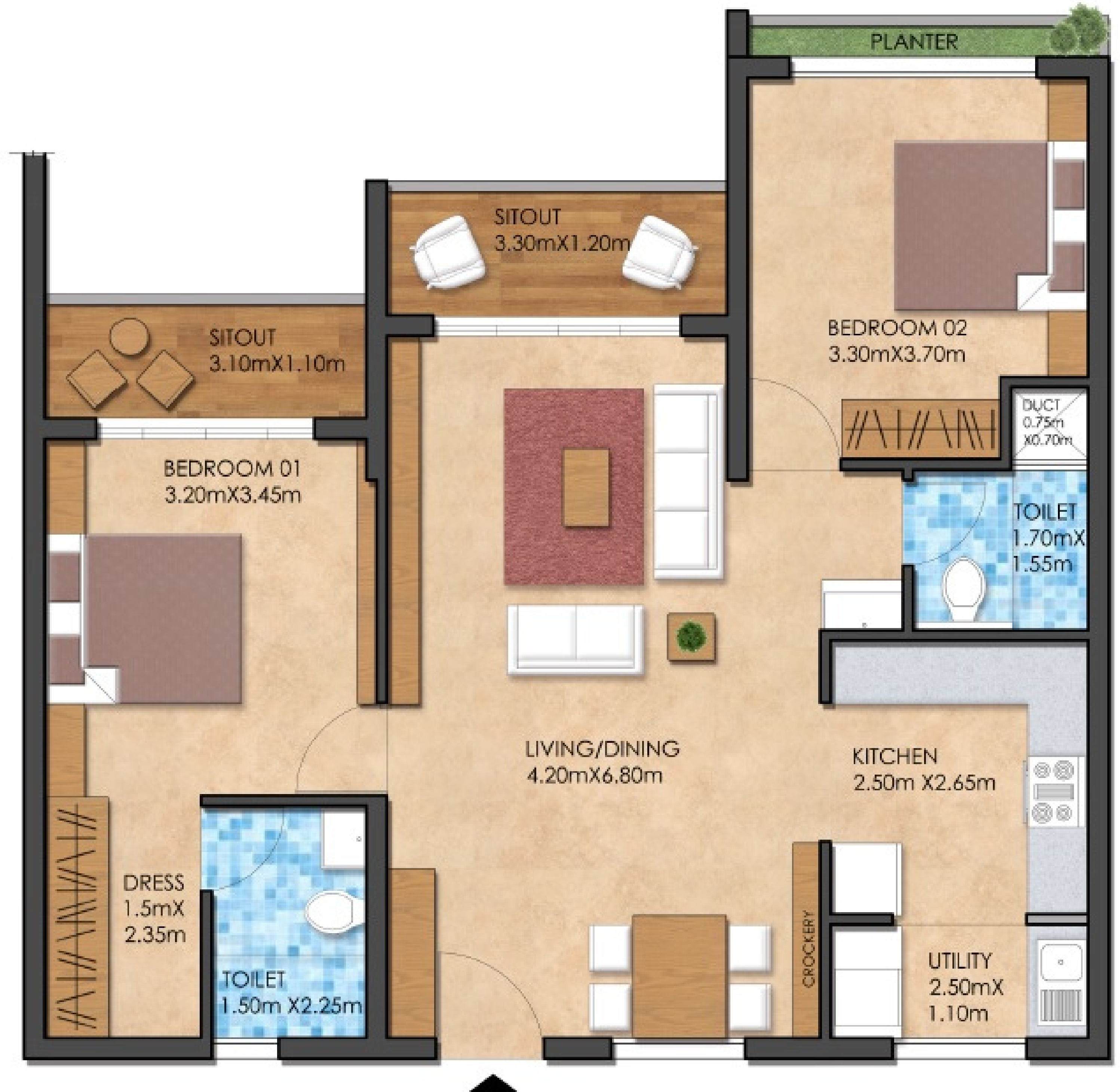
TYPE - 005 PLAN