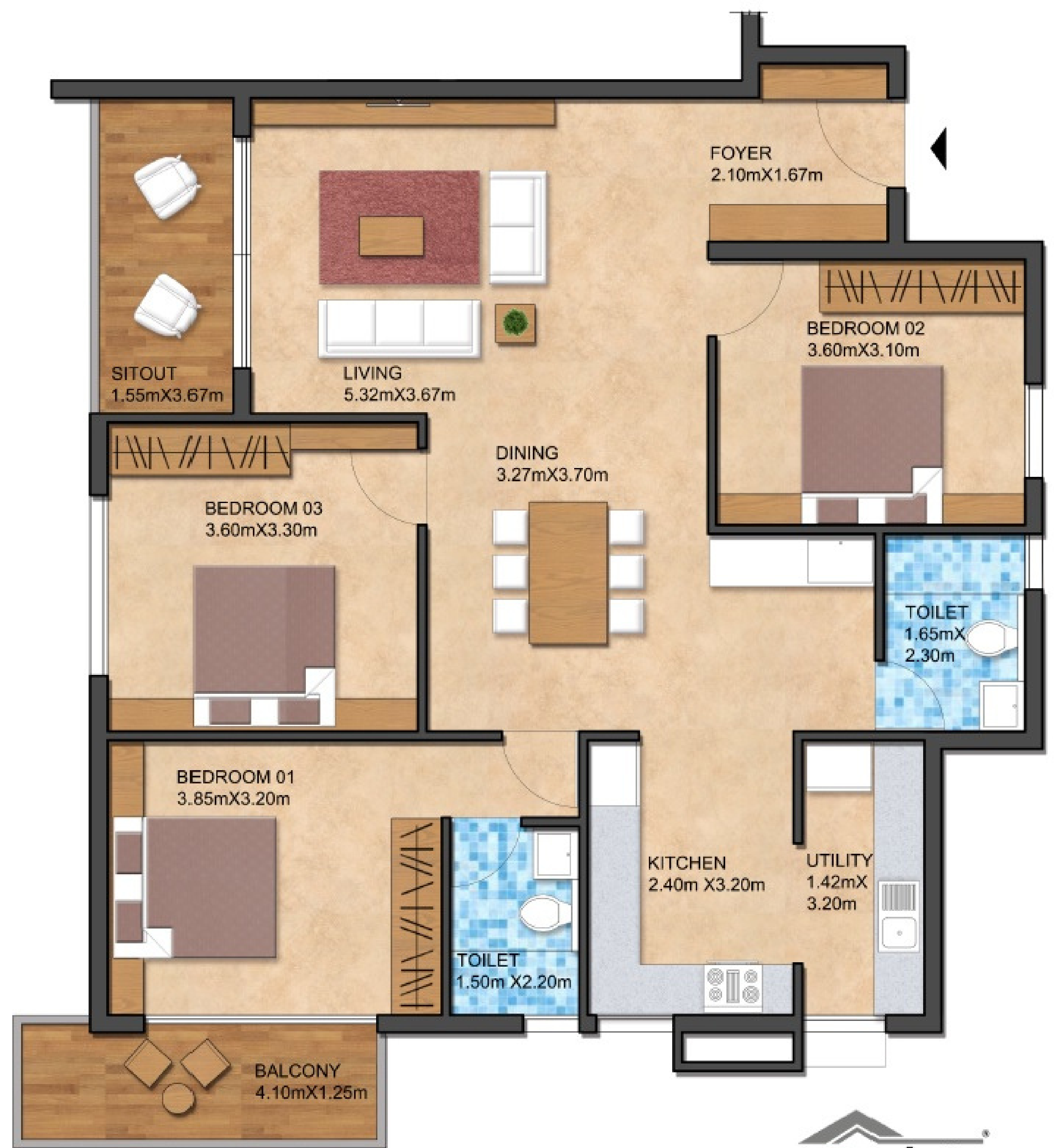
TYPE - 008 PLAN