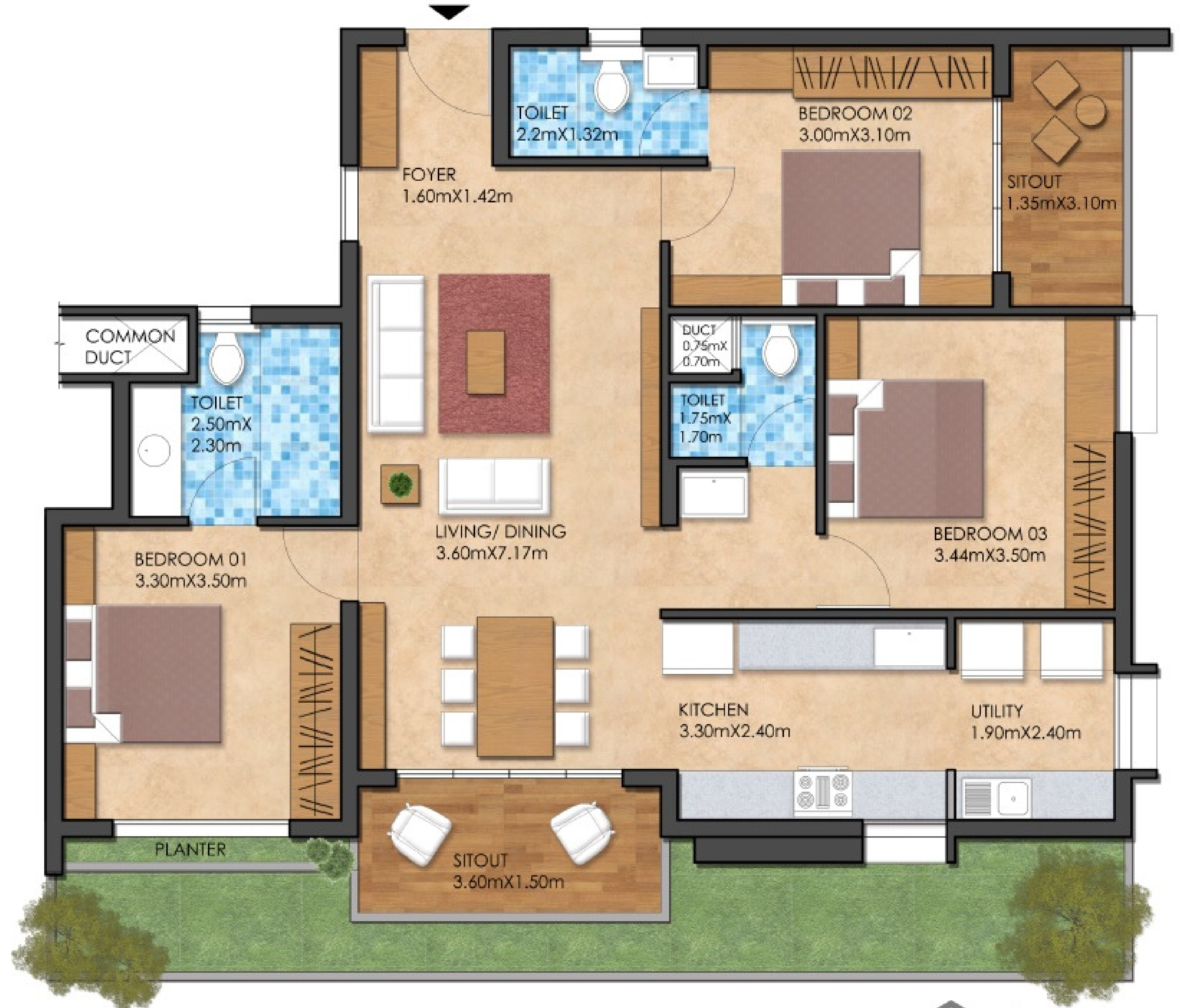
TYPE - 0C 2 PLAN