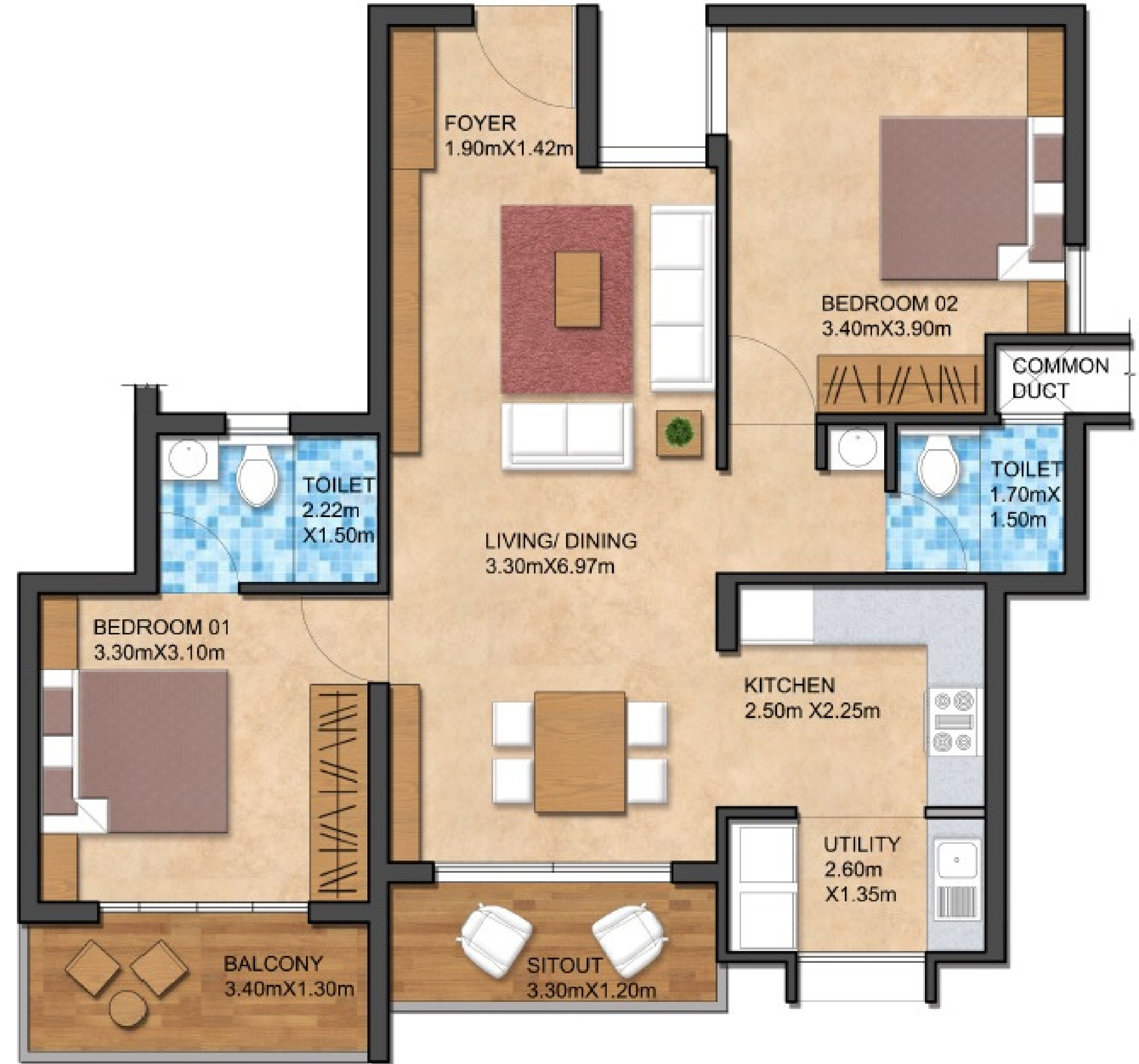
TYPE - 006 PLAN